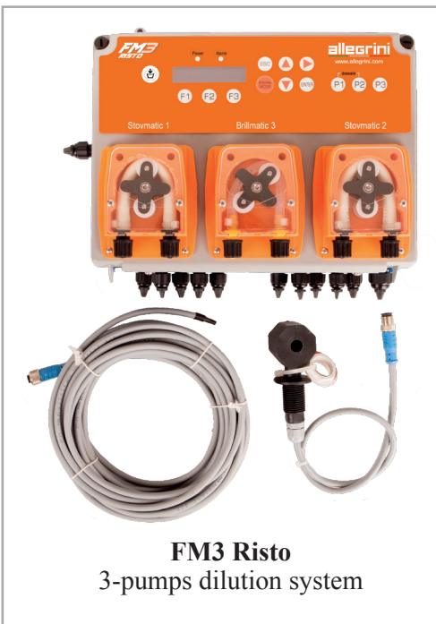
FM3 Risto 3-pumps dilution system

The care to detail that is shown in the attention to correct functioning of the products for the professional dishwashers and periodic inspections of maintenance of the dosing systems makes the method by Allegrini an effective solution to the problems linked to multiple aspects of savings: time, costs and consumptions.